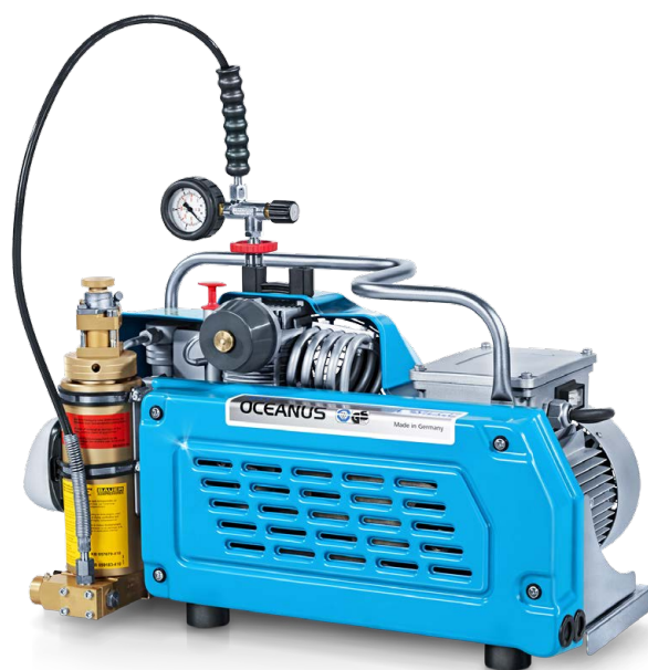
OCEANUS seen from rear with 300 bar filling hose