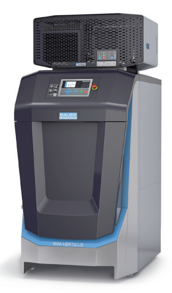
B-KOOL II 680i on top of MINI-VERTICUS