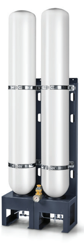
Storage system B 160 for 330 bar