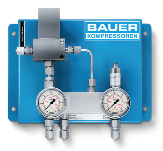
Automatic selector unit

When the maximum filling pressure is reached in the storage system, the compressor shuts down again entirely automatically. As soon as the next empty air cylinder is connected to the filling panel, the fully automatic filling cycle starts again from the beginning.