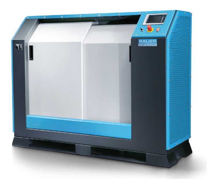
B-SAFE 300 Safety filling system

The B-SAFE thus replaces costly protective measures for filling facilities and provides operators with a high level of (legal) security.